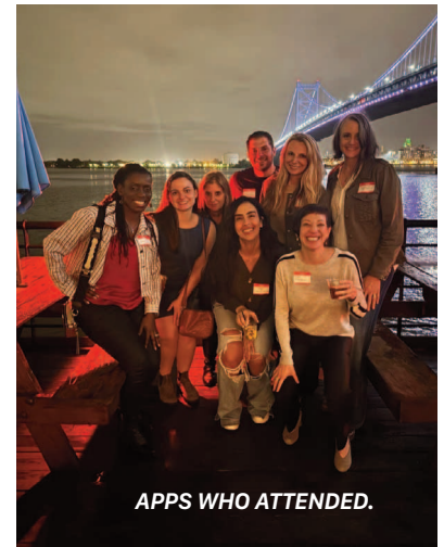
APPS WHO ATTENDED.