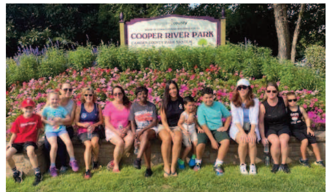
A PHOTO FROM THE WELLNESS WALK THAT WAS HELD ON AUGUST 25.

A brisk walk around the 3.7 mile Cooper River Park Loop at a roughly 20-minute mile pace. It will give us the opportunity for Cooper's providers to connect with one another.