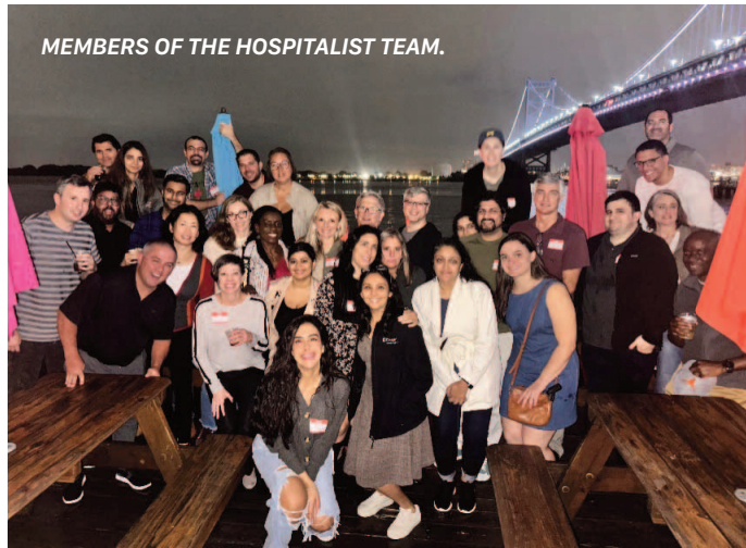
MEMBERS OF THE HOSPITALIST TEAM.

held a social at Morgan's Pier at the foot of the Ben Franklin Bridge in Philadelphia to introduce new providers who recently joined Cooper and to celebrate APPs. We have a total of 67 APPs that provide 24-7 coverage across Cooper Hospital Medicine and all our 11 partnering organizations.